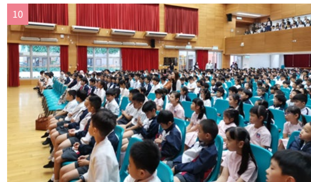
09-10 / 密匠於丹拿山循道學校分享街童貧窮的生活，學生們十分留心聆聽。 A talk detailing the lives of street children was given to students at Chinese Methodist School, Tanner Hill and they listened carefully.