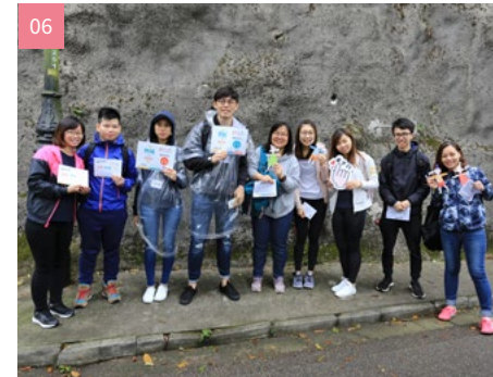
06-08 / 參加者沿途要完成不同的任務。 The participants had to complete different tasks in the walk.