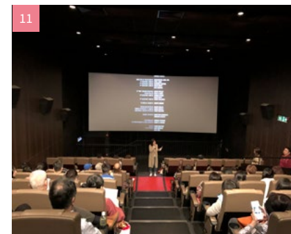
11 / 出席「星仔打官司」電影慈善活動的嘉賓都能更深體會街童的困難。 People joining the Charity Movie of "Capharnaum" could understand more about the difficulties of the street children.