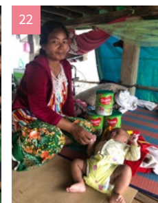
20 / 我們幫助這位有腹水的婦人接受治療。 We helped this lady who suffered from ascites to have medical treatment.