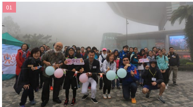
01 / 起步禮在惡劣的天氣下順利進行。 Kick-off ceremony was held in the bad weather.