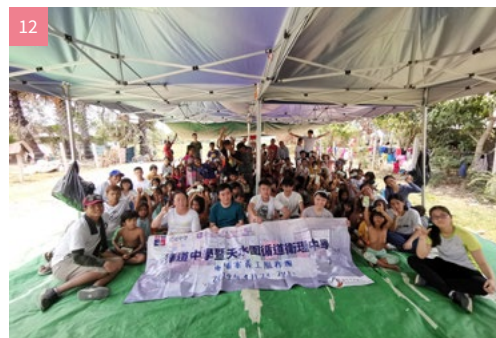
12-13 / 循道中學及天水圍循道衛理中學的學生在復活節期間到柬埔寨進行義工服務。 The students of Methodist College & Tin Shui Wai Methodist College went to Cambodia for voluntary service in Easter.