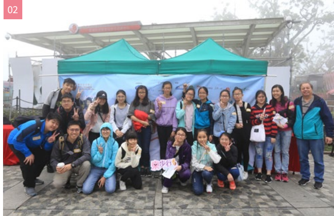
02 / 中華傳道會李賢堯紀念中學動員師生一同參加，讓年青人學習以行動關心柬埔寨有需要的人。 Teachers and students of CNEC Lee I Yao Memorial Secondary School joined the event, which enabled the youth to care for the needy in Cambodia.

The annual Metta Charity Walk was successfully held on 23 March 2019. Though it was windy and rainy, the participants were positive regardless, and enjoyed the game spots a lot. A total of HK$190,000 was raised for supporting our Children and Youth services.