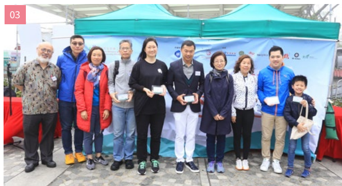
03 / 密匠董事與得獎單位合照。 Group photo of Metta's board members and the winning parties.