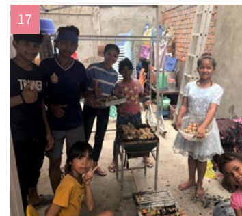
17 / 孩子們享受在中心燒烤。 The children enjoyed BBQ at centre.