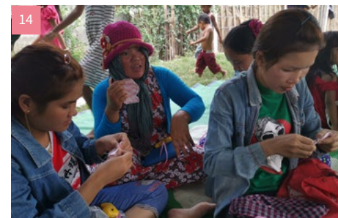
14-15 / 密匠開始教導鄉村婦女手工藝，她們都用心製作呢！ The ladies at villages were trained to do the handicraft; they all made it!